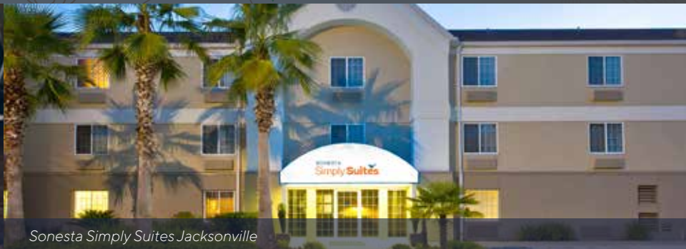
Sonesta Simply Suites Jacksonville