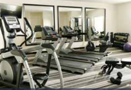
Sonesta Simply Suites Nanuet