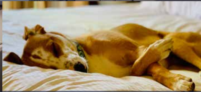
Sonesta Simply Suites Dallas Galleria