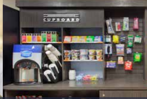
Sonesta Simply Suites Huntsville