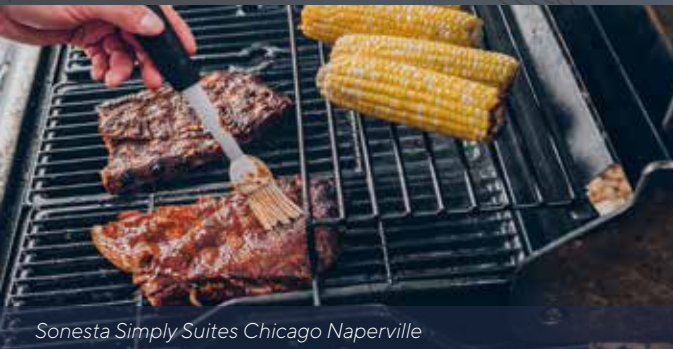
Sonesta Simply Suites Chicago Naperville

17 BRANDS | 1200+ PROPERTIES | 100,000+ ROOMS