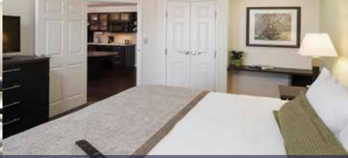
Sonesta Simply Suites Albuquerque