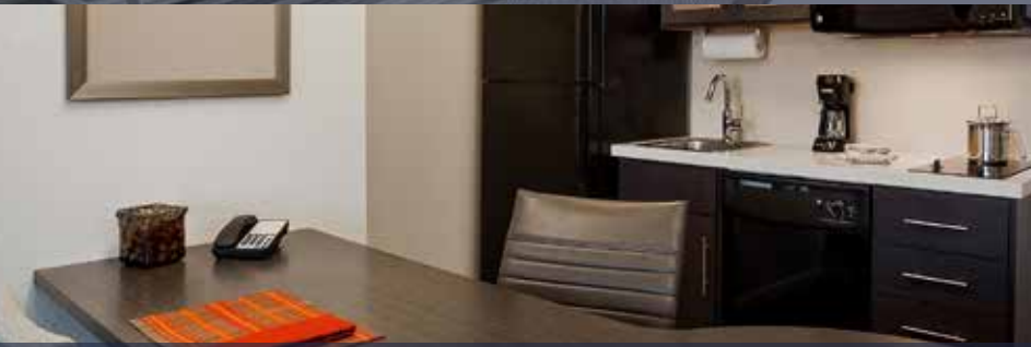
Sonesta Simply Suites Irvine Spectrum