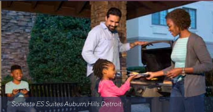
Sonesta ES Suites Auburn Hills Detroit