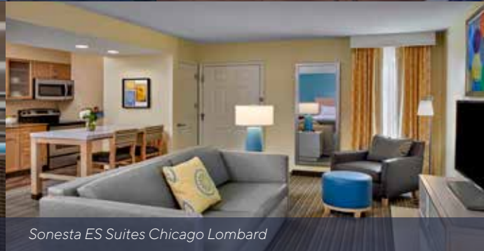
Sonesta ES Suites Chicago Lombard