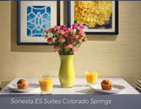
Sonesta ES Suites Colorado Springs