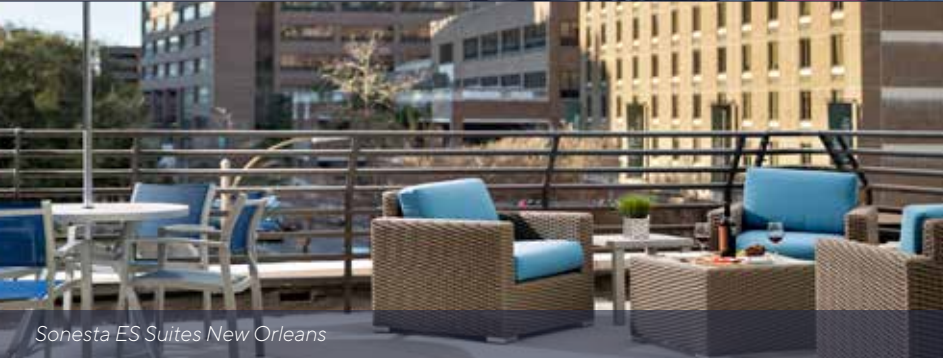
Sonesta ES Suites New Orleans