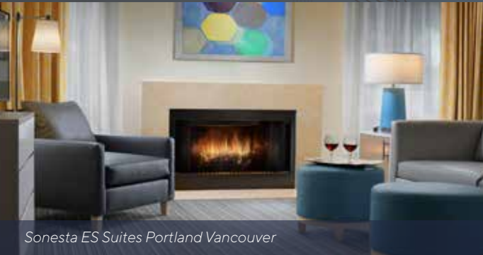
Sonesta ES Suites Portland Vancouver

17 BRANDS | 1200+ PROPERTIES | 100,000+ ROOMS