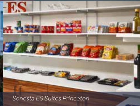
Sonesta ES Suites Princeton