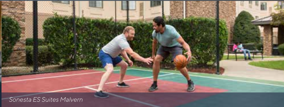
Sonesta ES Suites Malvern