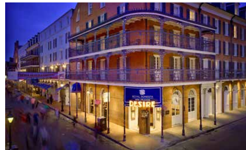
The Royal Sonesta New Orleans

In 1995 Red Lion went public and in 1996 was acquired by Doubletree . In 2001, G&B (using the name Cavanaugh’s and then WestCoast Hospitality) grew again, acquiring Red Lion Hotels brand and properties from Hilton (who had recently acquired Doubletree). The $51M acquisition expanded the footprint to include every western state but New Mexico and created a portfolio of 90 hotels and 15,000 rooms most of which were rebranded as Red Lion.