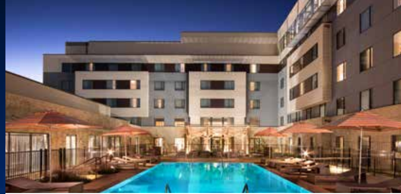
Sonesta Bee Cave Austin

Sonesta, the 8 th largest hotel company in the U.S., has its foundation in the integration of Sonesta International Hotels Corporation and Red Lion Hotels Corporation. These two entities trace back to 1937, and today, over 85 years later, are united with 17 brands, 1,200+ hotels, throughout 8 countries.