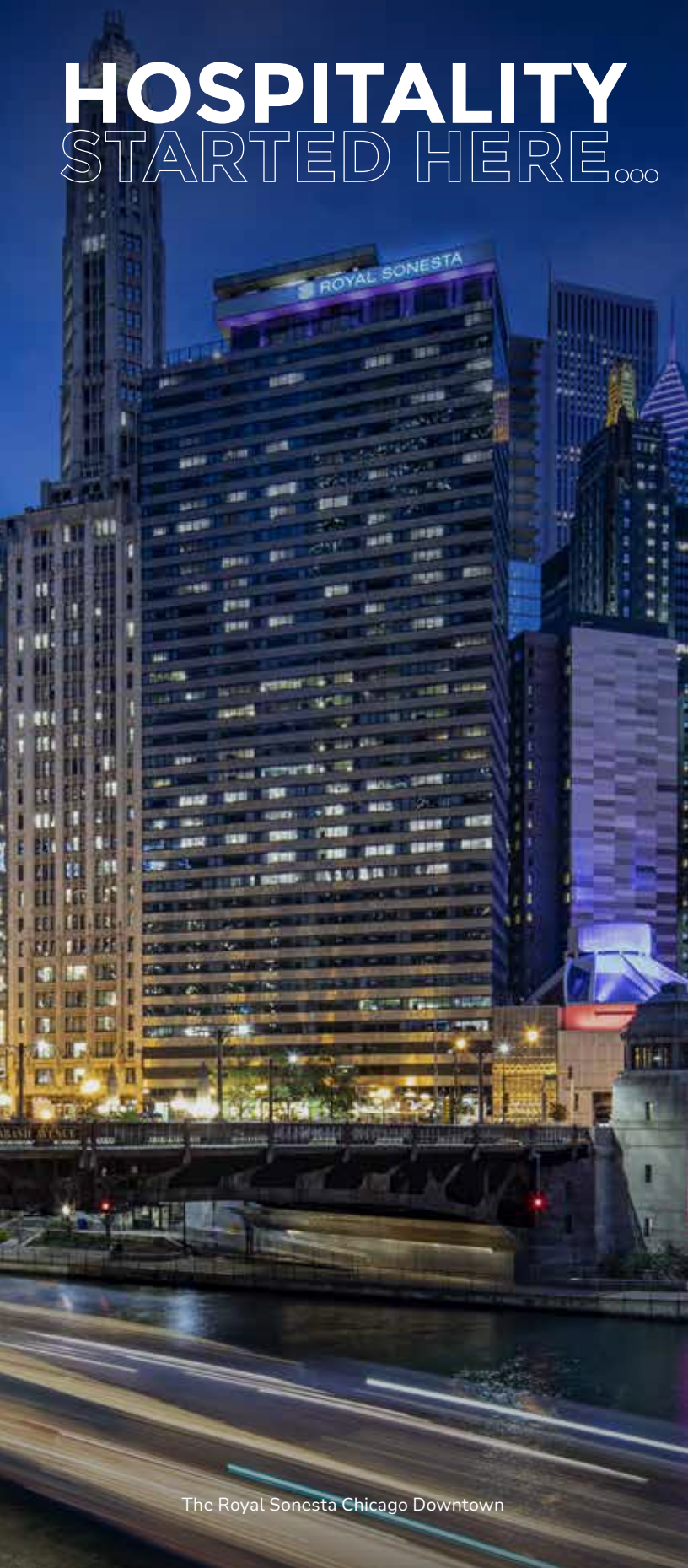
The Royal Sonesta Chicago Downtown