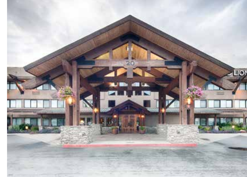
Red Lion Hotel Kalispell