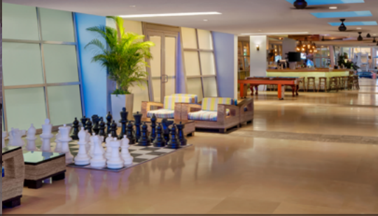
Z Ocean Hotel, Classico Collection by Sonesta