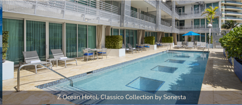
Z Ocean Hotel, Classico Collection by Sonesta