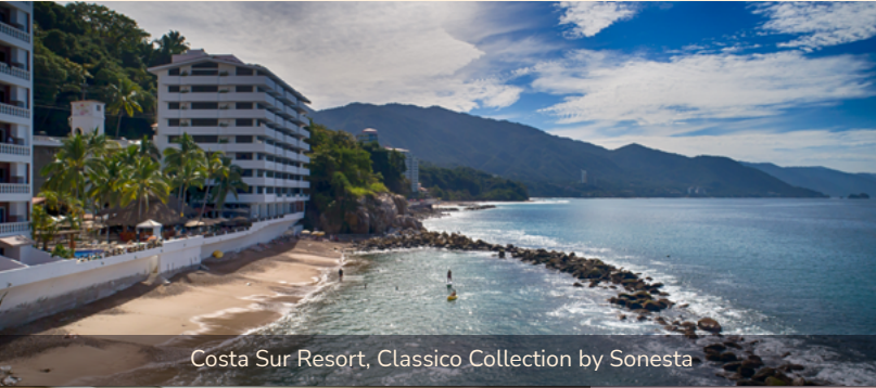
Costa Sur Resort, Classico Collection by Sonesta

8 th LARGEST hotel company in the US | 1,100+ properties | 100,000+ rooms | 13 brands | 9 countries | 1 POWERFUL loyalty program