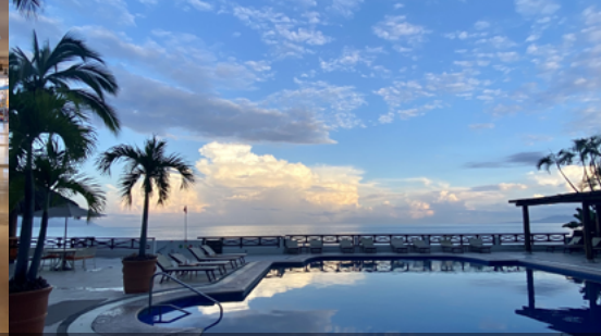
Costa Sur Resort, Classico Collection by Sonesta