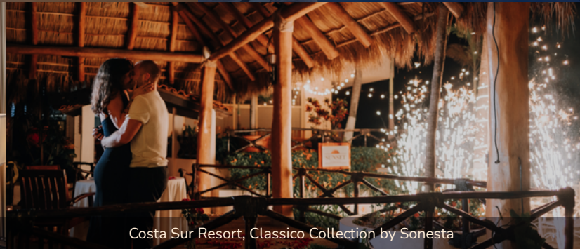
Costa Sur Resort, Classico Collection by Sonesta