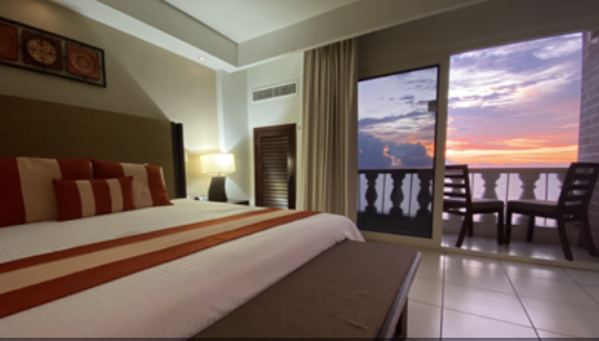
Costa Sur Resort, Classico Collection by Sonesta