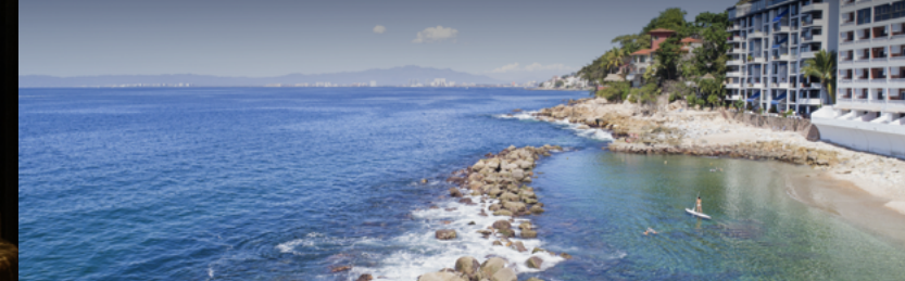
Z Ocean Hotel, Classico Collection by Sonesta