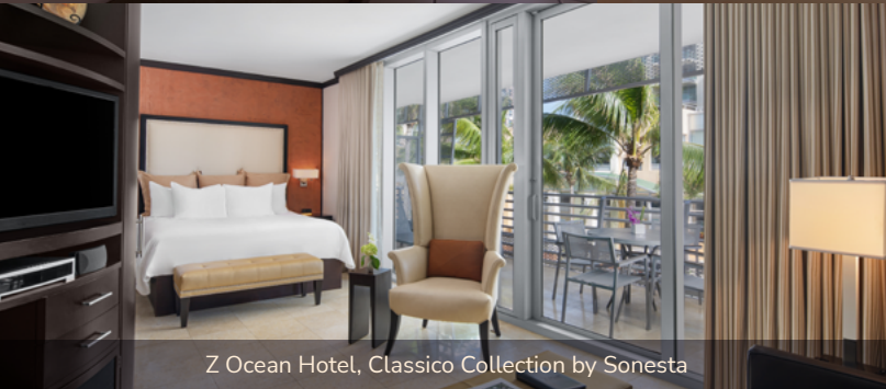
Z Ocean Hotel, Classico Collection by Sonesta