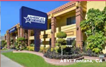
ABVI Fontana, CA