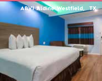
ABVI Aldine, Westfield, TX