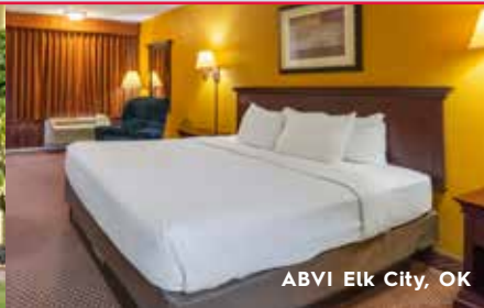
ABVI Elk City, OK